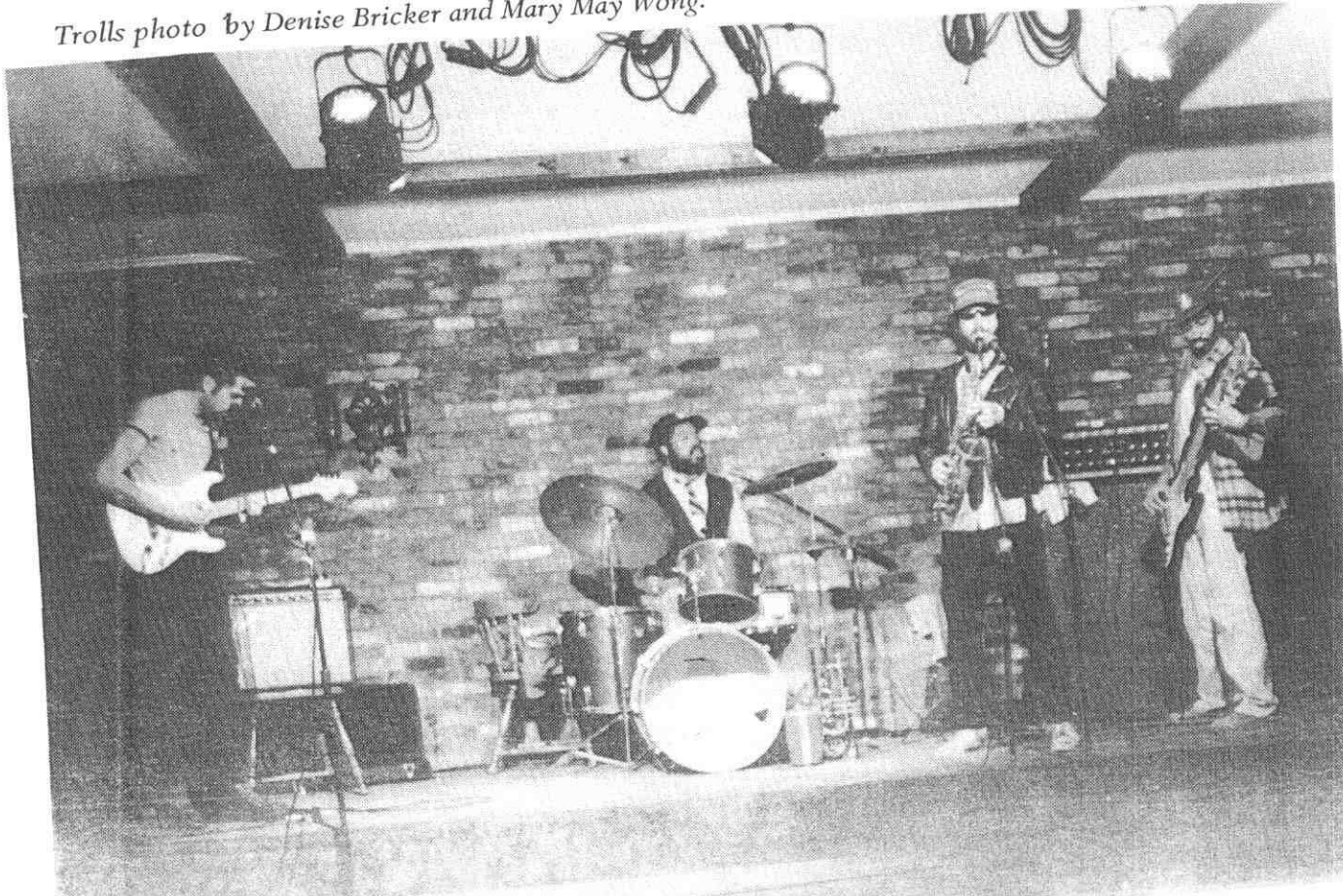
Trolls