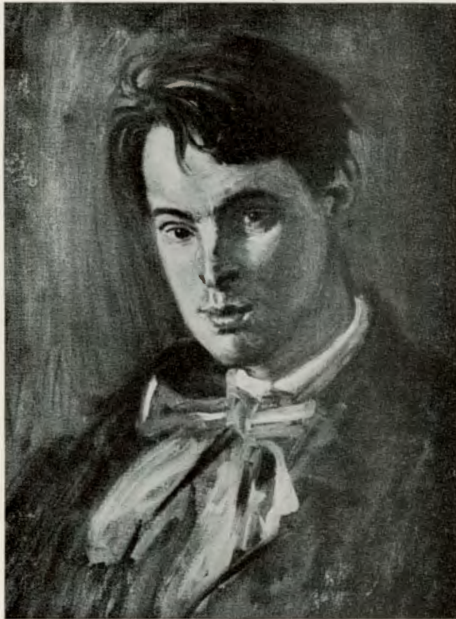
W. B. YEATS. 1907.

from the portrait by Augustus John, O.M., R.A. (in the possession of Dr. Oliver St. John Gogarty).