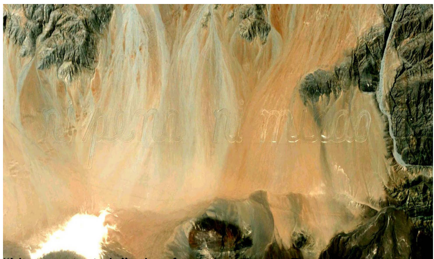
"Ni pena ni miedo" taken from above in the Desert of Atacama.